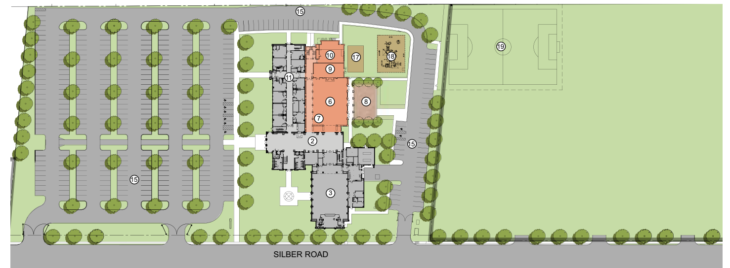
PHASE 1B REVISED – The updated phase 1B plan.