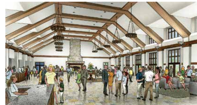
GATHERING HALL RENDERING – Artist's rendering of new addition which will provide better space for gathering on Sunday and throughout the week.

SECOND FLOOR ENLARGED – The new addition will include a second floor for Code 45, as well as minor renovations to our administrative space to make room for new children's classrooms.